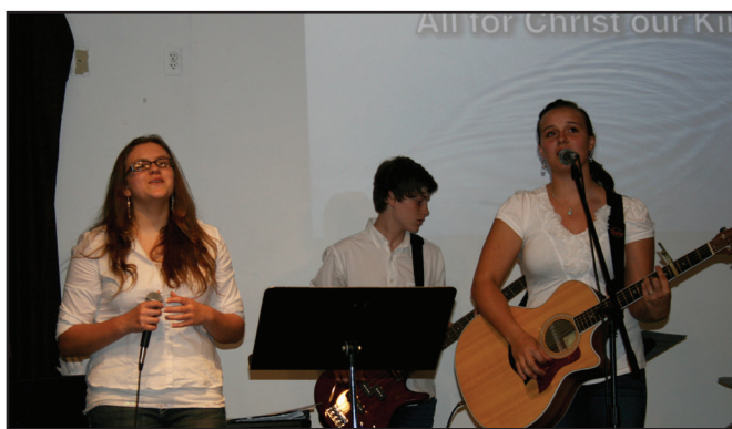
The student-led Night of Worship featured the high school worship team.