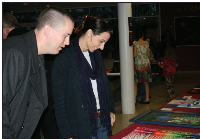
Visitors to the Arts Gala view art created by students.

I’ve stitched pants, braided hair, and wiped tears. I’ll help any student with anything they need!