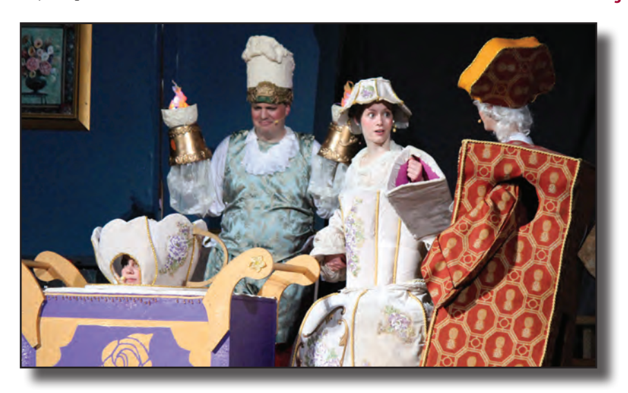
Chip, Lumiere, Mrs. Potts, and Cogsworth wonder if the spell cast over the castle will ever be broken.