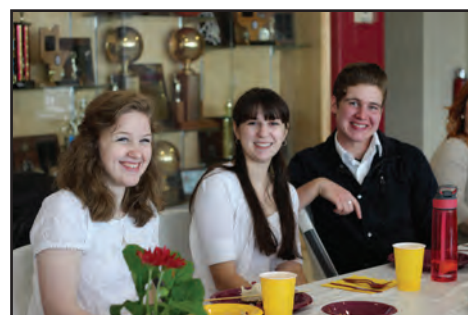
Trinity seniors personally invite faculty and staff to the White Day brunch, a treasured Trinity tradition.

student body, faculty and administration decided to capitalize on the momentum by adding Spirit Week and the Homecoming Game.