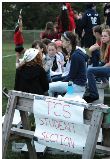
The Trinity student section cheered on the Warrior soccer team for the Homecoming game.

The Homecoming game was the culmination of a week filled with activities designed to usher in new traditions for Trinity. After the success of the first Homecoming Dance last year, the current