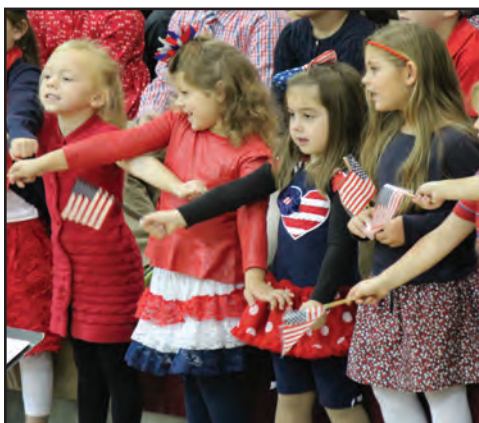
The elementary students sang enthusiastically for the annual Veterans Day Breakfast and Program.