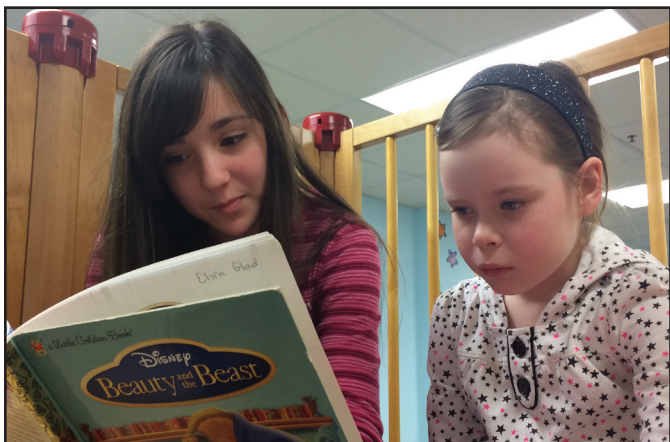
A middle school student reads to a preschooler on a Mentor Monday.