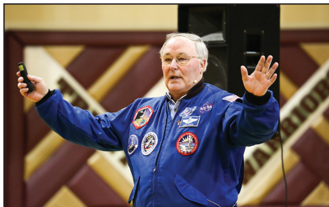
Astronaut Colonel Jerry Ross addressed the entire student body in January.

Astronaut Jerry Ross shares the world record for his seven space flights and ranks second among NASA astronauts for both the number of spacewalks and time logged on spacewalks. Now retired, Colonel Ross shared his experiences and his faith to motivate and encourage Trinity students to dream big and trust God.