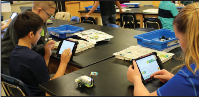
Students program their robots during middle school STEM class.

There is a great deal of buzz surrounding Trinity's STEAM programs. For starters, the secondary science department received the Buzz Aldrin ShareSpace Foundation grant, giving our students access to curriculum materials developed by Purdue University and the ShareSpace Foundation staff. Intended to ignite children's interests in science, technology, engineering, arts, and math (STEAM), the curriculum incorporates the Giant Mars Map™, a set of ten Welcome to Mars books and a VEX IQ robot which utilizes C language programming.