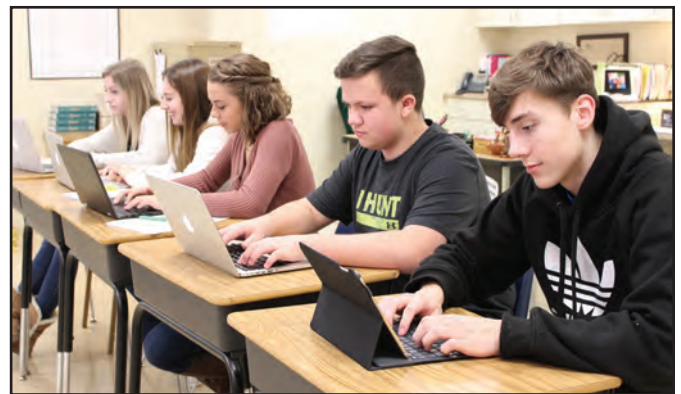
High school students will begin using Turnitin in January 2019.