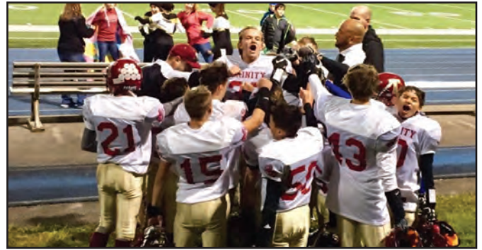
The middle school football team celebrates after a victory.

The Trinity middle school athletes made history when they completed the school's first season of middle school football. The team finished with a 2-6 record, gaining in experience and strength as the season progressed.