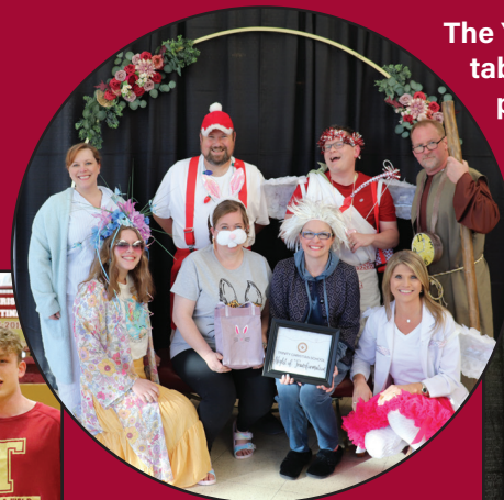
The Yost Hearing table (L) won top prize at the Spring Gala: A Night of Transformation.