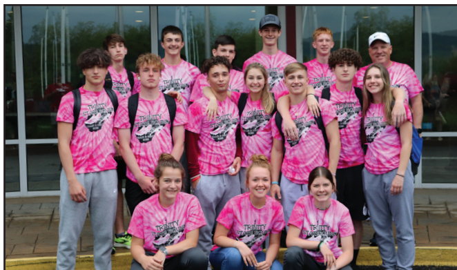
Track team state qualifiers pose before traveling.

“Dramatic improvement” is a good way to describe the middle school softball team’s second season as well. After a record of 2-7 in 2021, they finished 8-2 this year.