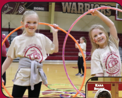
Students could hula-hoop or shoot hoops to help raise funds for the school at the Hoop-A-Thon.

Our Spring Gala had a new twist for 2022: Guests had the option of participating in a friendly competition by choosing a table theme, then decorating their table and dressing according to the theme. The table hosts outdid themselves by choosing a variety of creative and fun themes for a fun night of fellowship. Proceeds topped $22,000 to benefit Tuition Assistance! We can't wait to see what themes our guests come up with in 2023!