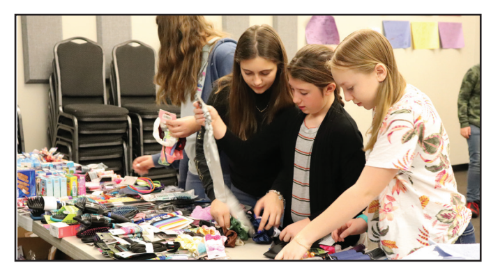
Students carefully select items to fill each shoebox.

Mentors and their buddies will work on another community service project in the spring.