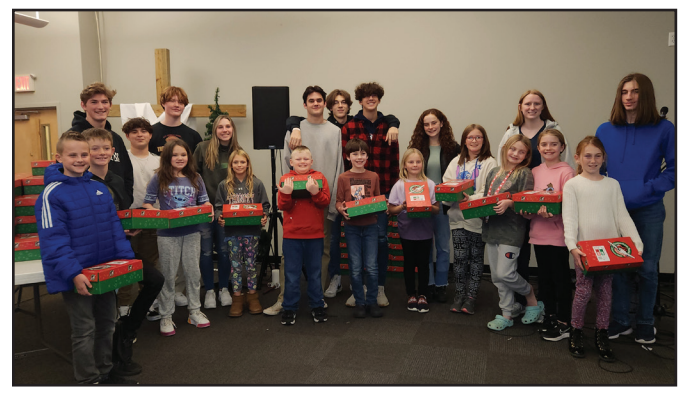
Mentors and their buddies pose after packing shoeboxes.