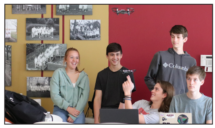
Students use laptops to fly drones at the Launch Party.

Through these projects and more, our students are gaining real-life experience in STEM fields.