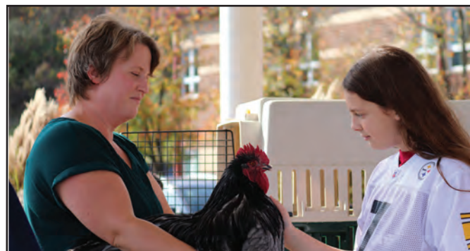
A Veterinarian Science student pets a chicken during class.

The school also introduced a STEM club for middle schoolers looking for an extra-curricular activity. Club members explored a variety of engineering and design challenges such as creating a roller coaster from paper.