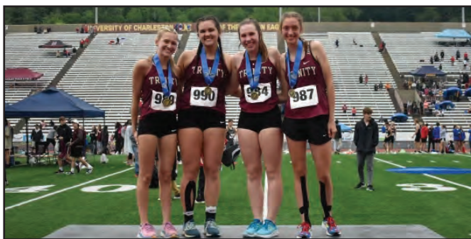
The State Champion 4x400 relay team on the podium.

Middle School Track – The boys team won the Mason-Dixon Championship.