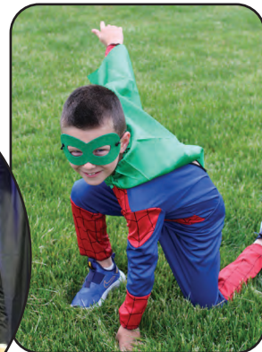
Above: A Capes & Tiaras runner poses.