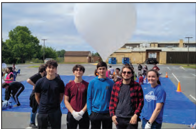
The West Virginia team at the test launch site in Maryland.

The evening began in the school's foyer where guests enjoyed student artwork created in a variety of media including a digital art display. It continued in the gym, where students of all grade levels performed instrumental and vocal pieces to an appreciative crowd. The evening ended with an awards ceremony for students who were recognized for their outstanding artwork as voted on by guests. The Night of the Arts was a lovely reminder that the arts are alive and well at Trinity Christian School.