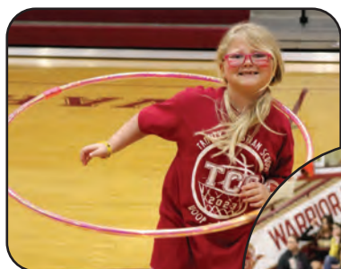
Above and Right: Students hula-hoop and shoot hoops at the Hoop-A-Thon.

"Now to Him who is able to do far more abundantly than all that we ask or think, according to the power at work within us, to Him be glory in the church and in Christ Jesus throughout all generations, forever and ever. Amen." - Ephesians 3:20-21