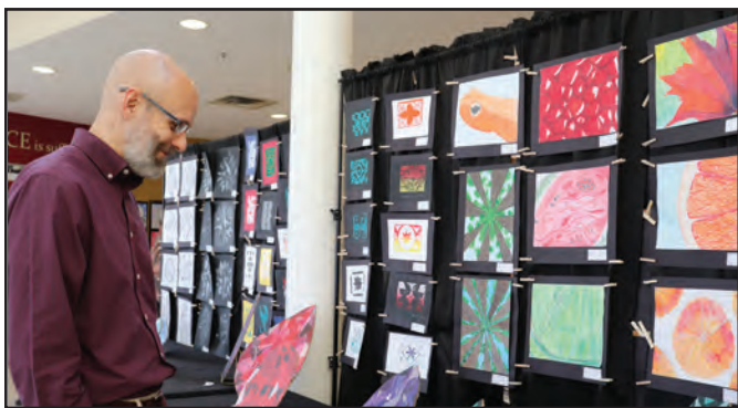
Guests viewed student artwork at Night of the Arts.