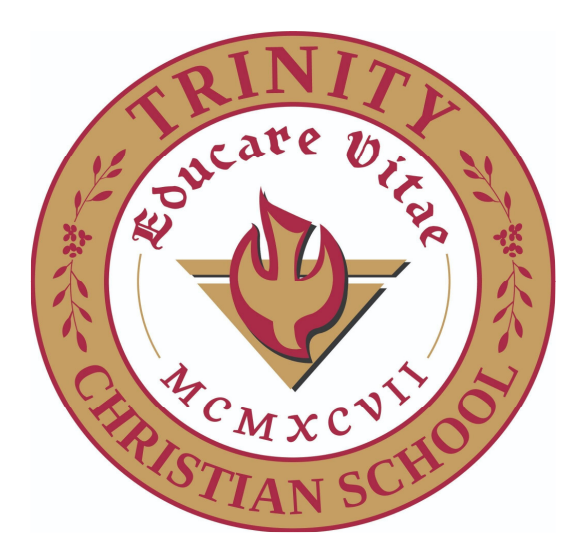
Educating for Life

"The Lord is a Warrior; the Lord is His name." Exodus 15:3