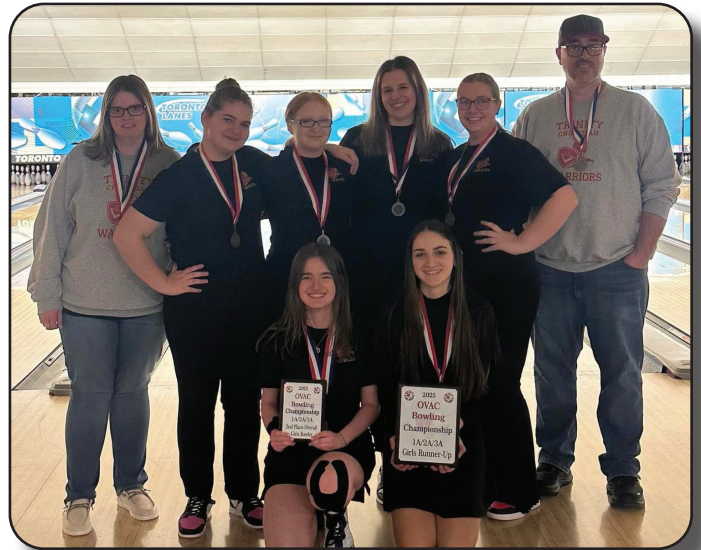
Top Right: Girls Bowling Team and Coaches - OVAC Runner-Up