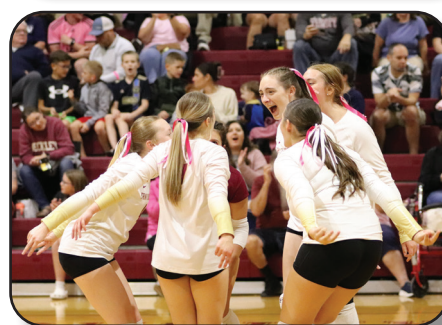
Photos (Top to Bottom): Cross Country Team Leaves for States; 2025 Golf Team; Soccer Team Post-Win Celebration; Volleyball Team Celebrates at Game.